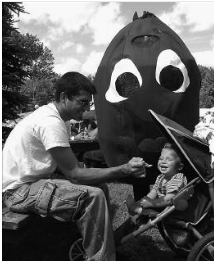
The Blueberry Man and two happy festival attendees

The festival is held each year on the second Saturday of August. The whole event is offered to our Lady as a gift, as is the entire school, and, while hoping that the event generates needed funds, those involved know that there is much more to the story.