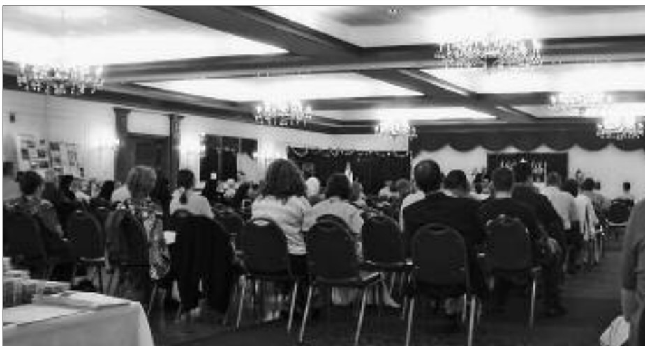
Some of the attendees at our tenth annual conference