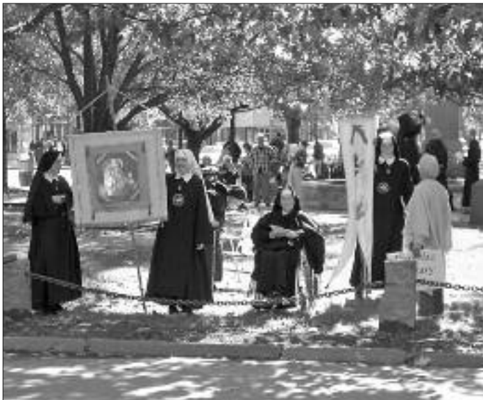
Our sisters with their banners at the Rosary rally on Keene Common.