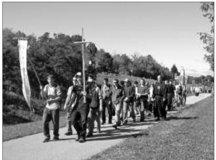
St. Joseph's Brigade marching on the last day of the pilgrimage.