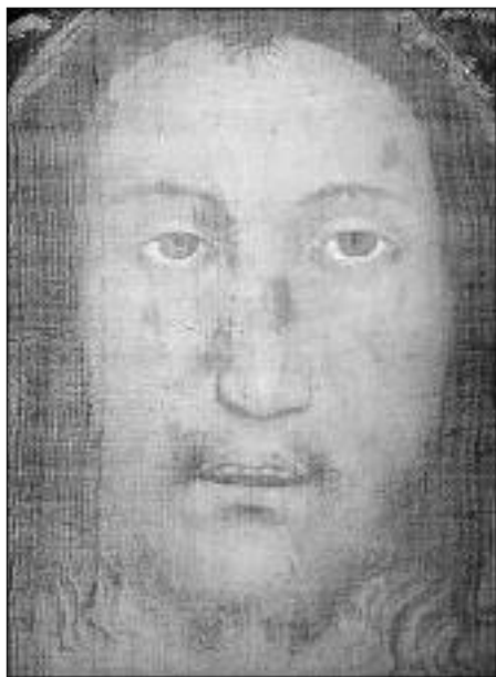
Image on the Veil of Manoppello