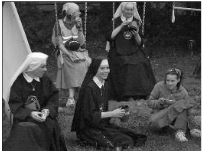
Some IHM Brigade members at one of the campgrounds.

The grueling walk itself was made more bearable by the light-heartedness of so many friends, urging each other on in charity. Step-by-step, side-by-side, we were able to turn the physical pain into a competitive booster, the harsh weather a challenge in patience, and the arduous monotony of the hike a cause for reflection and prayer. All the common hardships and laughter served to make the hours pass quickly. I would like to add that this pilgrimage is a fruit of that spirit of Christendom that we are trying to keep alive and nourish. It is born out of a Catholic environment, and we get to enjoy it first hand. It has become an invaluable treasure in my life, and I hope that many other Catholics who take their faith seriously will come to discover it for themselves.