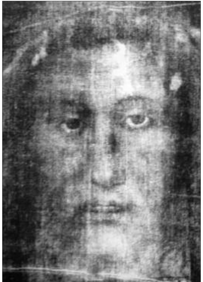
The Holy Face image imposed over the Shroud of Turin.