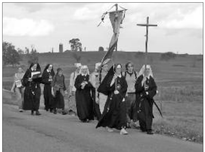
IHM Brigade walking during some stormy weather.