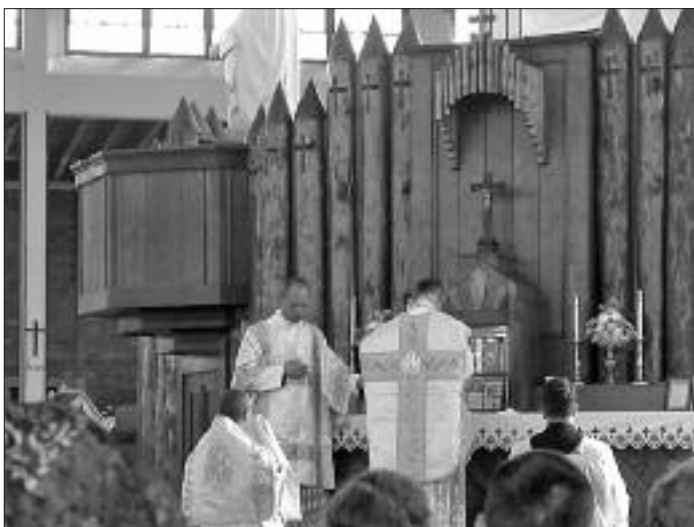
The pilgrimage ends with a solemn high Mass at Auriesville.