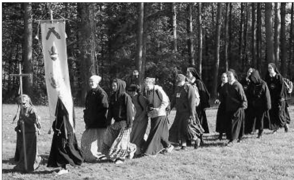
The Immaculate Heart of Mary Women's Brigade

I must borrow the words of another, "The pilgrimage may not be good for the soles but it is definitely good for the soul."