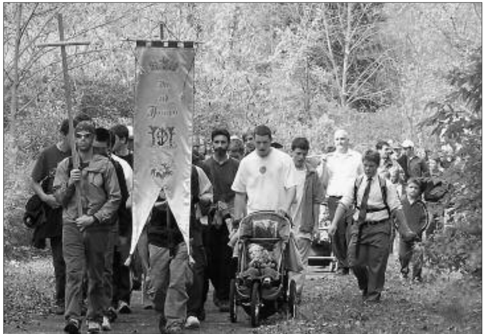
The St. Joseph Men’s Brigade

participating next year will write the Center for more information. To appreciate fully and savor the fruits of this American Pilgrimage, one must do the walk. Yes, “your feet will hurt,” as one wise veteran assured me before we set out. And, guess what? By the end, my feet did hurt. However, I had the satisfaction of knowing that I had participated in (to put it mildly) one of the most rewarding spiritual events of my life. To put the whole pious adventure into capsulized summation, I must borrow the words of another individual who said: “The pilgrimage may not be good for the soles but it is definitely good for the soul.” Hopefully, next year more people can come along to endure the penitential challenges that the pilgrimage has to offer. I’ll be back again. Hope to see you there, too.