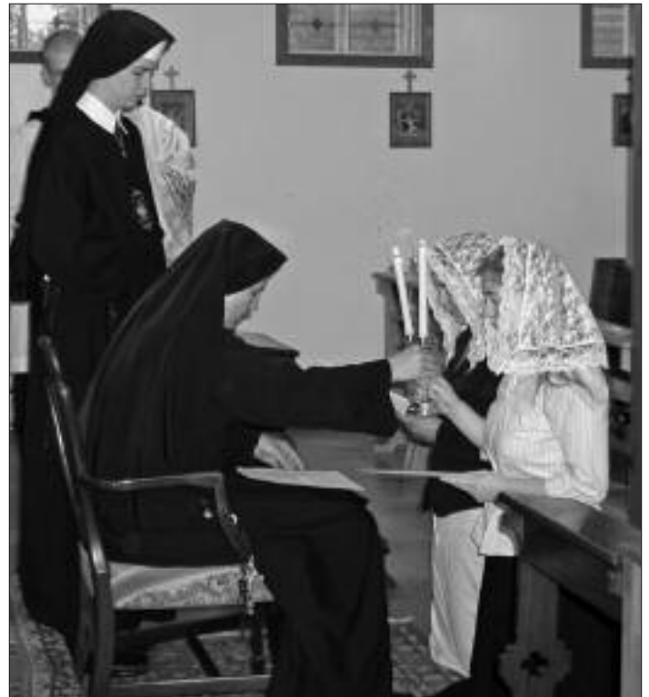
Two young ladies entering the Postulancy, August, 2006.

More than the acknowledging of our dependence on the Blessed Virgin is our voluntary donation of self. This is expressed by the term "consecration," St. Louis' name for the central act of his devotion: "Total Consecration to Jesus through Mary." To "consecrate" is to set something aside for a holy purpose. Church buildings are consecrated, and so are chalices, ciboria, and other sanctuary appurtenances. Because they are consecrated, they cannot be used for profane (i.e., non-religious) purposes. Certain people are also "consecrated": Bishops are not merely "ordained," but receive "Episcopal Consecration." Religious, when they take their vows, are spoken of as