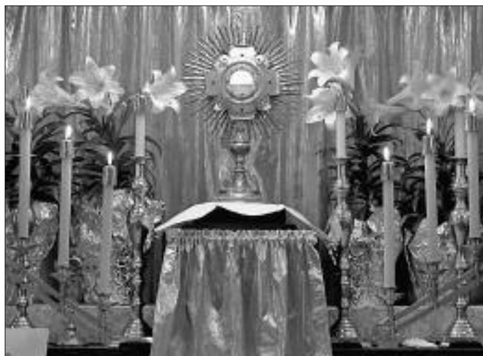
Eucharistic Adoration in IHM chapel during Eastertide.

see the point of the Incarnation of the Son of God.