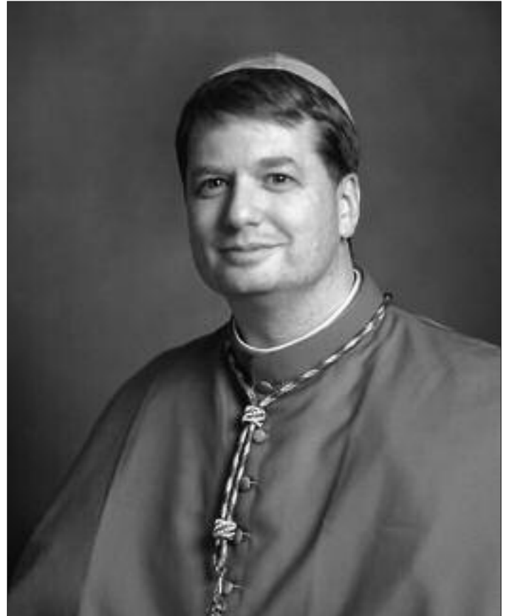
Bishop Anthony Fisher of Sydney, Australia

How can the Church reestablish her moral authority in the wake of so many scandals and so much doctrinal ambivalence? Announcing a year of penitence among her members would help; the consecration of Russia would help; the restoration of the traditional liturgy would help; but most of all, the reaffirmation of the doctrine of salvation would help. After all, if one can be saved while denying the authority of the pope, then what is the purpose of a solemn magisterium? Our Lord did not give His vicar a lectern but a cathedra .