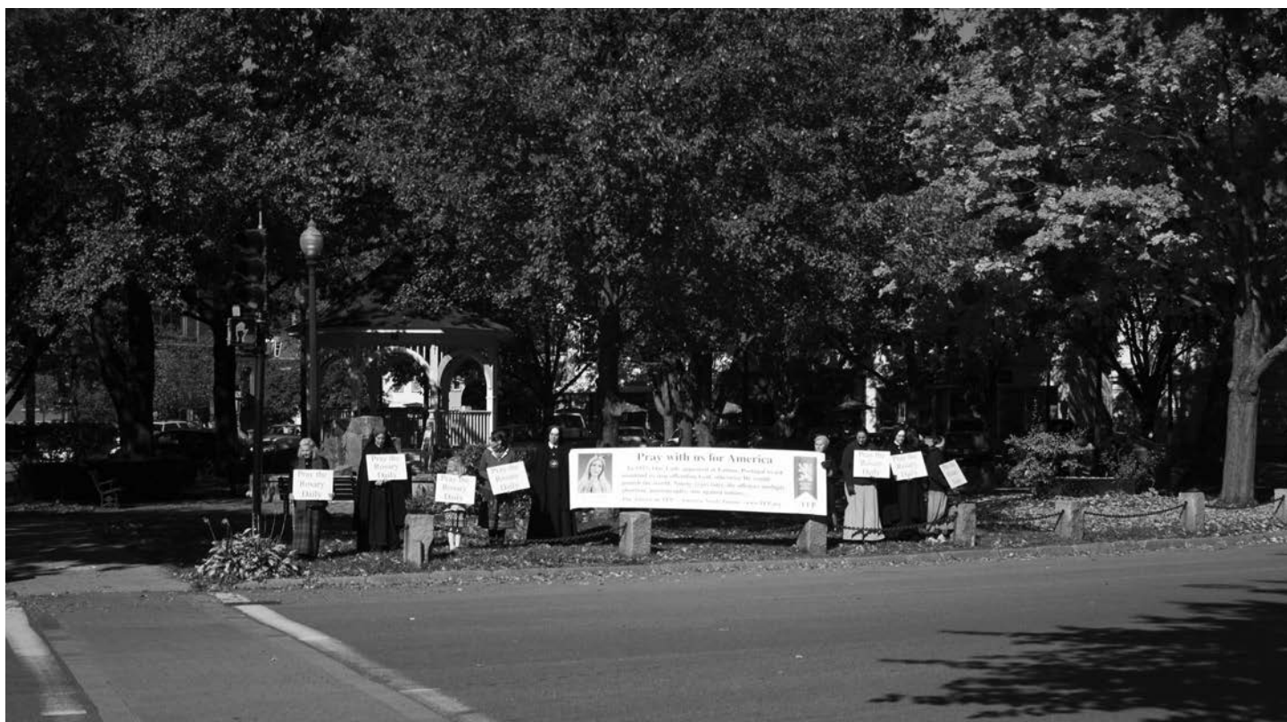
Friends of Saint Benedict Center held a Rosary Rally at Central Square, Keene, NH

So let us be realistic. Every true Catholic ought to be “preoccupied” with the Church’s teaching on salvation when we consider the hierarchy of ends. Our first charity to our neighbor, if we have the Faith, can be nothing less than assisting him in attaining the ultimate Good. And we religious, who are employed by Christ to announce His Name to all men, ought to be warning the whole world that whosoever is traversing a path