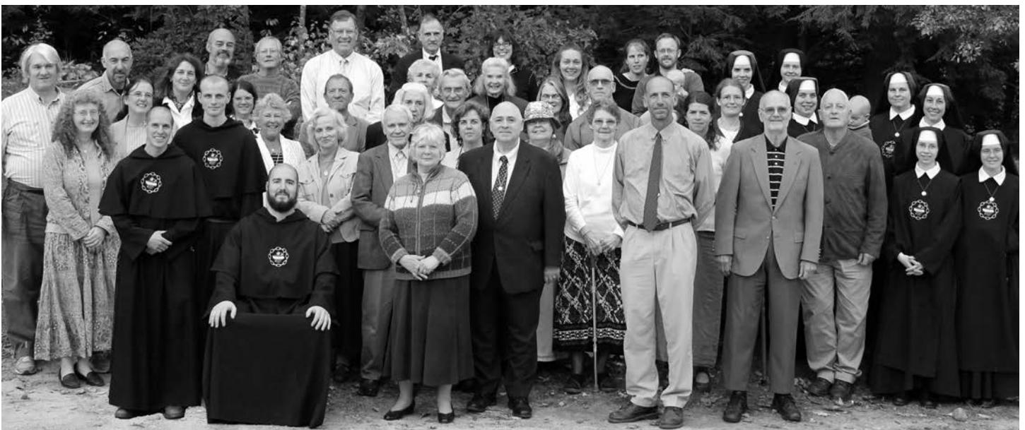
The first, second, and third order members of the Slaves of the Immaculate Heart of Mary who attended this Conference

But the Cardinal is certainly not alone as a victim of this interested historical revisionism. According to a certain degenerate reading of the Scriptures, the relationship between such