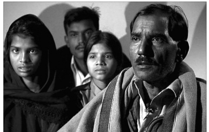
The family of Asia Bibi