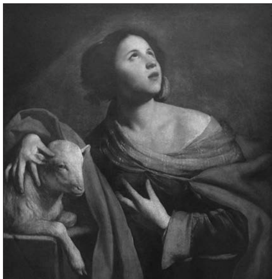
Saint Agnes, virgin martyr

Now let's take a look at the saint for whom a town in Vermont, which lies on the shores of Lake Champlain, is named: