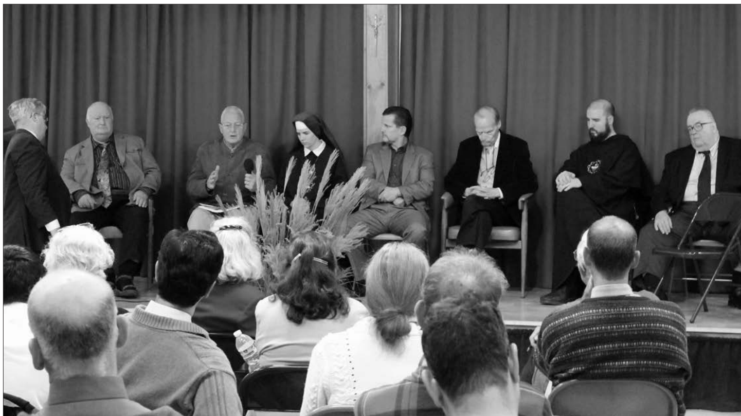
Panel Discussion at 2012 Conference