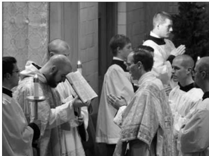
For the feast of the Epiphany: a Solemn High Mass in Keene, NH