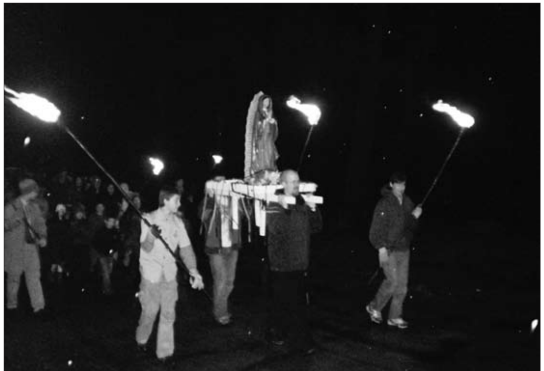
The torch-lit procession on the way to the bonfire in honor of Our Lady of Guadalupe.

He used to say over and over again: "Speak the truth," "Never tell a lie, because God is Truth."