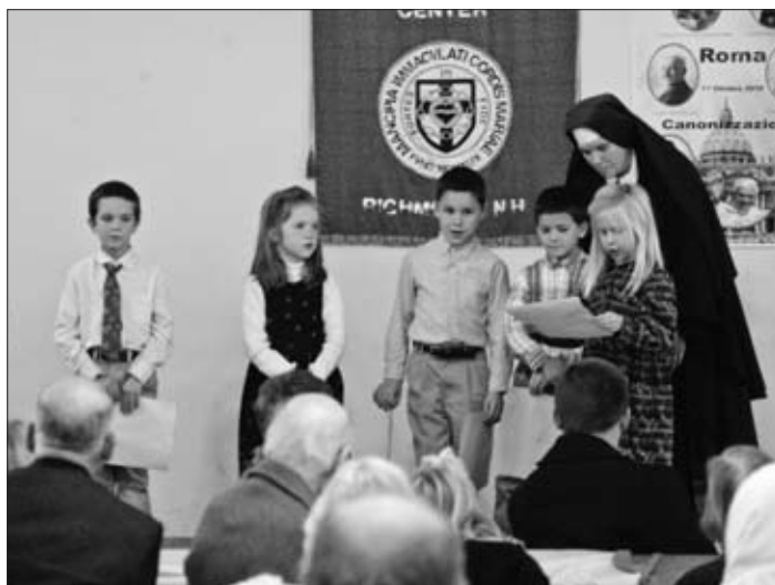
The 1st and 2nd graders read their spiritual bouquets to Father