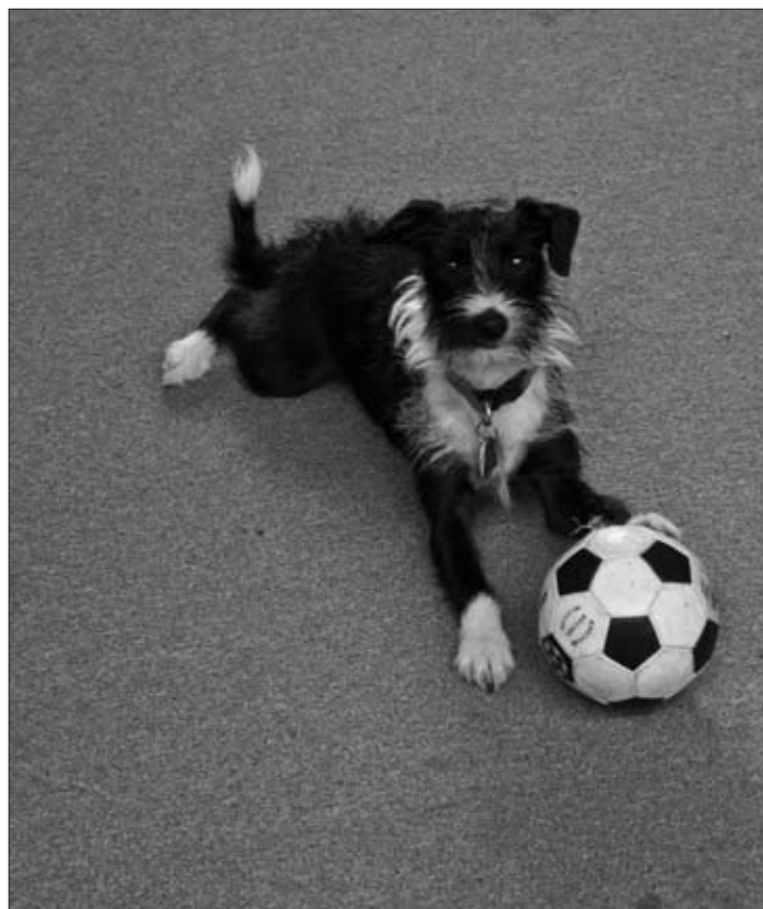
One of Father's daily visitors, Huan.