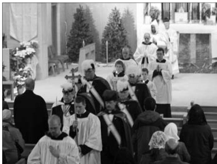
In addition to the servers, there were six Knights of Columbus assisting