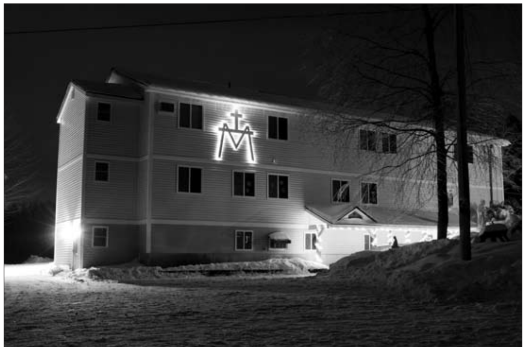
As a last upgrade to Saint Paul’s house, a lighted emblem of our Lady was installed on the wall

“Be happy when you are corrected.” “One way to abuse a child is not to cor- rect him!”