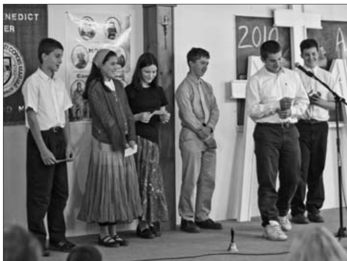
The junior high school recited poems written for him.