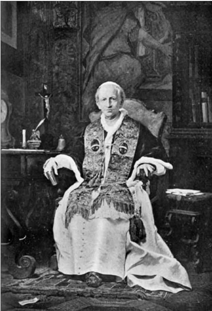
Pope Leo XIII

I had the privilege this year to teach a whole course in