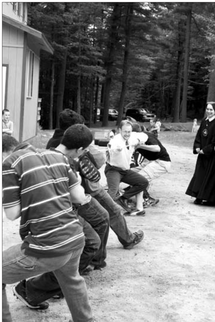
One of the competitions at IHM School's Field Day, held on the last day of the school year and followed by ice cream and prizes.