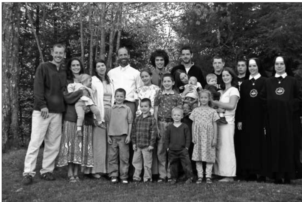
Three generations of the Bryan family

"Don't buy anything your great-grandmother wouldn't recognize as food"