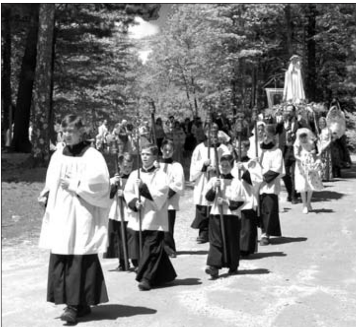
We had a great turn-out and weather for our May Crowning this year