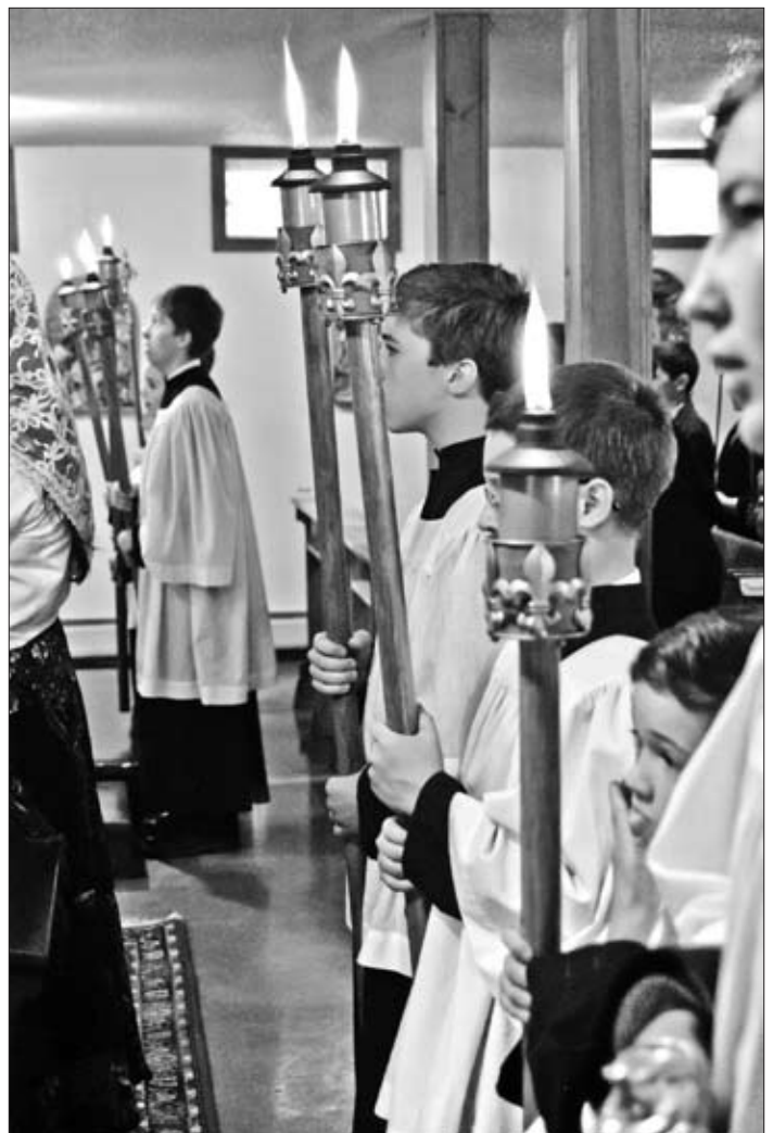
After the crowning and procession, we had Benediction in our chapel